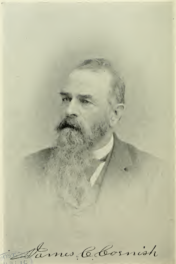
OF PINE HILL, N.Y.